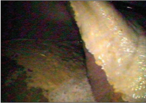
Figure 2. Normal stomach showing nonglandular and glandular mucosae and margo plicatus at the lesser curvature in a horse treated with phenylbutazone (horse #375).