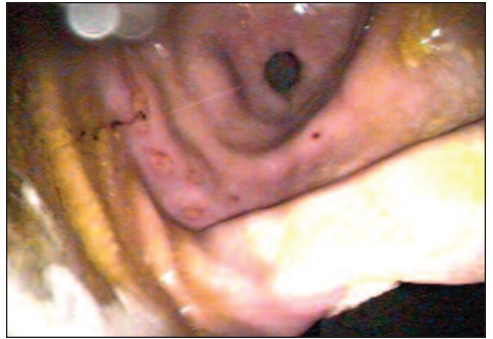
Figure 4. Gastric ulcers present in the glandular stomach in a horse receiving suxibuzone orally (horse #209).

The findings here showed that both SBZ and PBZ top-dress formulations were readily consumed and that neither formulation—given at recommended doses—caused gastric ulcers over what would be expected in mature horses housed in stalls and fed hay and grain twice daily. Furthermore, SBZ treatment did not have an advantage over PBZ in causing fewer or less severe gastric ulcers in the healthy horses in this study. However, it must be emphasized that long-term use (>15 days) of these