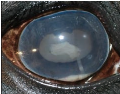
FIGURE 1. Acute changes characterized by corneal edema and aqueous flare with fibrin in the anterior chamber. Note the hypopyon (leukocytic exudate) settling on the ventral floor of the anterior chamber.